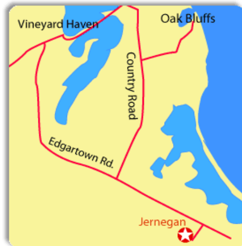
Just minutes to downtown Edgartown and a short ride to State Beach are just some of the amenities offered by this new Captain's Colonial from R..H. Burpee Company.